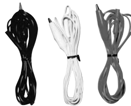
Voltage Input Sensor