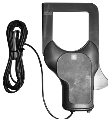
Model CT-80 Big Window Current Sensor 80 \phi mm 1000A max