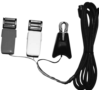
Model PS-60 Non-contact Type Voltage Sensor