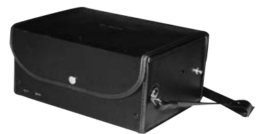
Hard Carrying Case