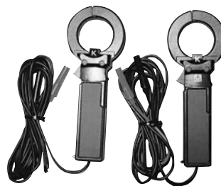
Current Sensor CT-40(600A max)